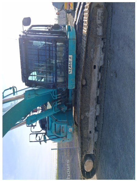
Tyre Condition 3